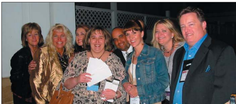
Arizona attendees at the HSMIA Leadership Forum in Memphis proudly display the chapter awards.

So, the next time you receive an Arizona HSMIA program announcement, think about those birds flying in formation, and be an active part of your community.